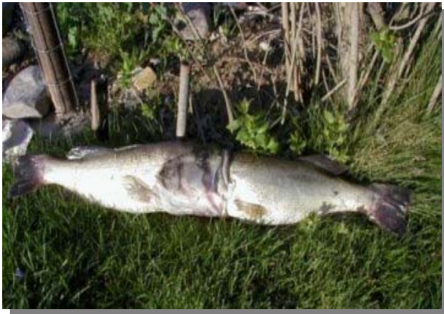
How bee-zar is this!?!? You've seen it on the website—it's no urban legend.

Mai l i n g A d d r e s s L i n e 1 M a i l i n g A d d r e s s L i n e 2 M a i l i n g A d d r e s s L i n e 3 M a i l i n g A d d r e s s L i n e 4 M a i l i n g A d d r e s s L i n e 5