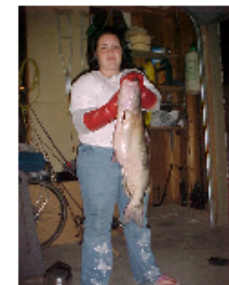
Blue Gill nest robber—a Kelsey Cat...fish